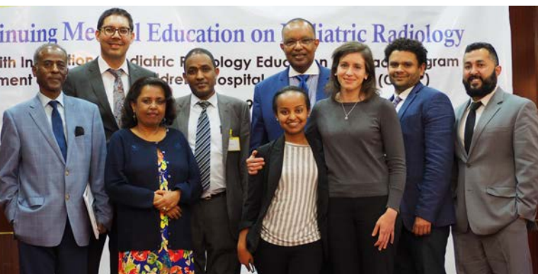
January 2019 visiting faculty at the National CME Course in Addis Ababa, Ethiopia.