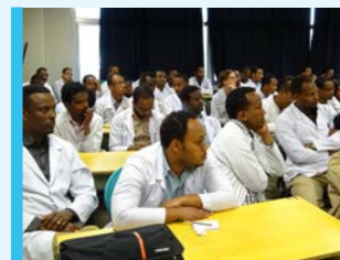
Black Lion hospital radiology residents.